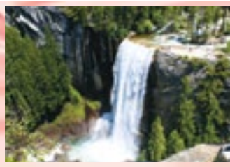
優山美地國家公園 / Yosemite