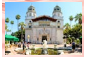
赫氏古堡 / Hearst Castle