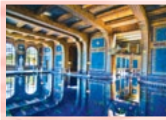
赫氏古堡 / Hearst Castle