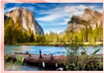
優山美地國家公園 / Yosemite

Visit one of the most beautiful national parks in the West — Yosemite. Breath taking sceneries like Bridalveil Fall, El Capitan, Merced River, Half Dome and Yosemite Falls will immerse your senses and bring you back to nature. The Yosemite Valley is one of the most visited spots in America, so make sure you bring plenty of film! Spend a night in Fresno.