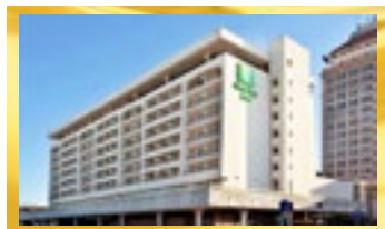
Holiday Inn (Fresno Downtown) Fresno