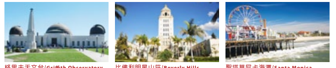
格里夫天文台/Griffith Observatory 比佛利明星山莊/Beverly Hills 聖塔莫尼卡海灘/Santa Monica

走訪中國城，欣賞著古雅典貴的牌坊。參觀位於洛杉磯發源地之一的Olvera Street，紅磚步道上覆蓋濃厚墨西哥色彩。不但可以看到洛杉磯最古老建於1818年的建築Avila Adobe，小攤販也販賣著各式各樣的墨西哥皮製特產和民俗藝術品，彷彿親臨墨西哥的傳統小鎮。參觀坐落於好萊塢山頂上這個號稱世界上最先進的Griffith天文台，有一架加州最大的巨型天文望遠鏡，也可以從山頂上眺望全洛杉磯的街景。驅車前往南加州的著名春藤盟校UCLA，沿著日落大道進入比佛利山莊，有電影“麻雀變鳳凰”情節中的街道Rodeo Drive和麗晶酒店Regent Beverly Wilshire Hotel。順道遊覽著名的聖塔莫尼卡海灘。隨後懷著喜悅的心情踏上歸途，於傍晚時分回到灣區。 Start your tour at Chinatown and be enchanted by the ancient-looking gateways. Stroll down Olvera Street, located in the oldest part of Los Angeles, depicted by the quaintness of Mexican culture. Visit the Avila Adobe, the oldest standing residence in Los Angeles that was built in 1818. Walk into the Mexican-style marketplace filled with various leather goods, and arts and crafts made in Mexico, as if you were in a traditional Mexican town. Arrive at the Griffith Observatory located on Mount Hollywood in LA; one can look through the largest Zeiss refracting telescope in California, as well as enjoy the scenic view of LA from high up the mountain. Pass by UCLA, the famous Ivy League School in Southern California, and then enter Beverly Hills through Sunset Blvd. Visit Rodeo Drive and Regent Beverly Wilshire Hotel, the filming locations in the movie Pretty Woman. Stop by the famous Santa Monica beach and pier before heading back to the bay area.